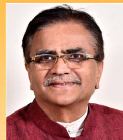
SHRI OM PRAKASH DHANKAR Hon'ble Agriculture Minister, Haryana