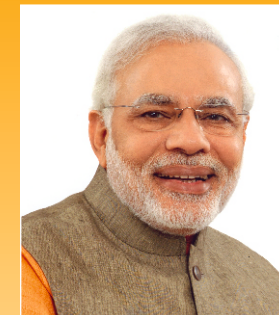
SHRI NARENDRA MODI Hon'ble Prime Minister, India