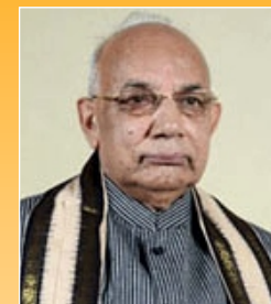
PROF. KAPTAN SINGH SOLANKI Hon'ble Governor of Haryana